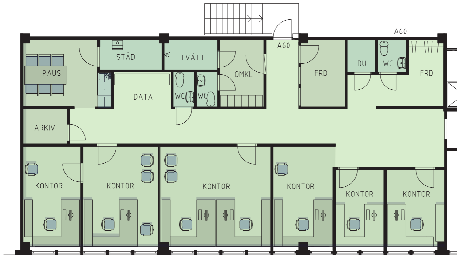
PLAN 1 / DEL AV 164 kvm