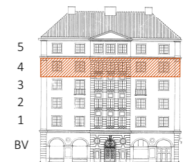
Fasad mot Karl Staaffs park